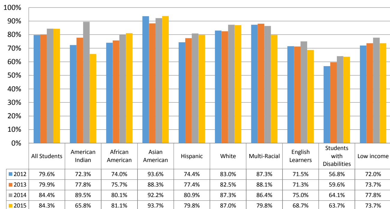
Figure 1: Four-Year Graduation Rates by Student Group, 2012-2015